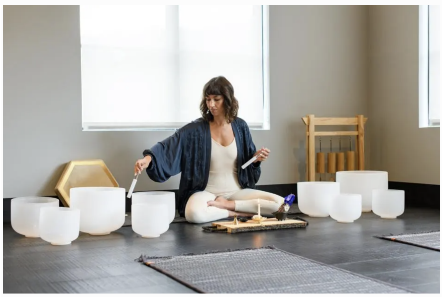
A sound bath is part of the holistic offerings.

Opened this summer and nestled along the downtown St. Petersburg waterfront, The Vinoy Resort & Golf Club completed the initial phase of a comprehensive renovation that resulted in a brand new Spa. Inspired by the therapeutic qualities of the ocean, the luxurious full-service Vinoy Spa embraces a holistic approach to health and well-being in a refined space. Welcoming guests with calming Naturopathica tea to set the relaxing mood from the start, the spa features four treatment rooms and focuses on coastal-inspired and plant-based therapies that provide a rejuvenating wellness experience, including massages, facials, full-body therapies and nail or hair services.