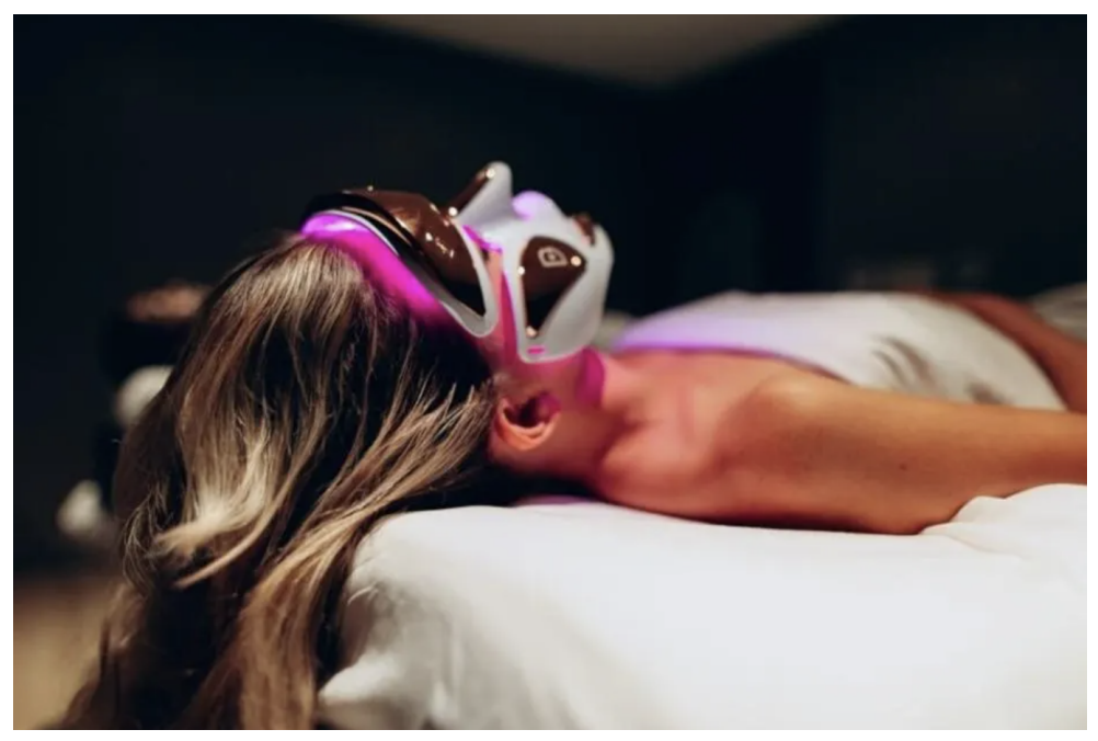
The Global Wellness Tourism Sector captures a large audience. THE VINOY RESORT AND GOLF CLUB

Over the past decade the global wellness tourism sector has gobbled up a huge segment of the travel industry's market share. Its size was valued at $814.6 billion in 2022 and is expected to expand at a compound annual growth rate (CAGR) of 12.42% from 2023 to 2030, according to Grand View Research . Wellness tourism includes activities aimed at improving and enhancing an individual's physical, mental and spiritual well-being. Tourists indulge in physical, spiritual and mental activities by practicing yoga, spas, meditation and Pilates, and by visiting hot spring resorts. The trend of interacting with the locals of the destination who have visited and experienced different cultures promotes personal well-being.