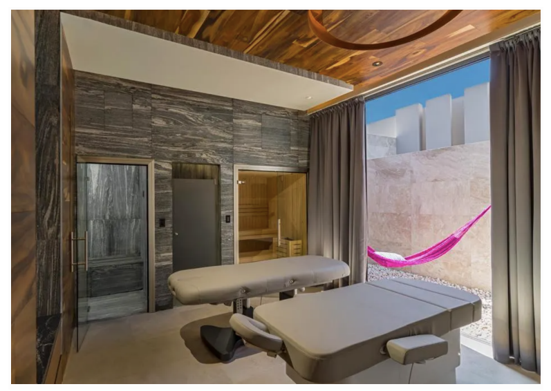
The Ojo de Liebre Spa is offering two festive treatments.SOLAZ