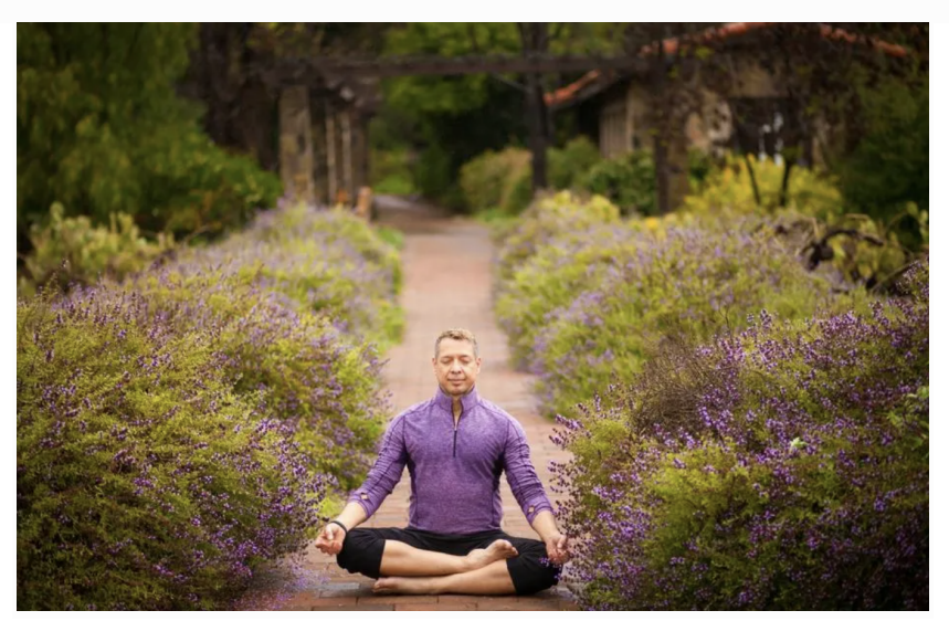
Specialty weeks at The Ranch are offered year round.RANCHO LA PUERTA

Recently opened in March, the spa offers their consulting wellness program where the spa concierge team will create a customized program for a 360-wellness experience that includes massages, breath work classes, a detox program, green cooking classes with the chef and more. Special for the holidays, the Ojo de Liebre Spa is offering two festive treatments: Sparkling Champagne Bliss: A curated treatment that begins with a rejuvenating grape-infused body mask and deluxe scalp treatment followed by a customized massage by one of the spa's skilled therapists. Festive Serenity Escape: Combining traditional massage techniques with seasonal essential aromas, this treatment creates the perfect harmony for mind, body and spirit, especially during holiday stress.