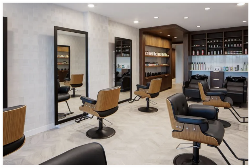
Celeste is located on the hotel's brand new wellness floor.AHC HOSPITALITY