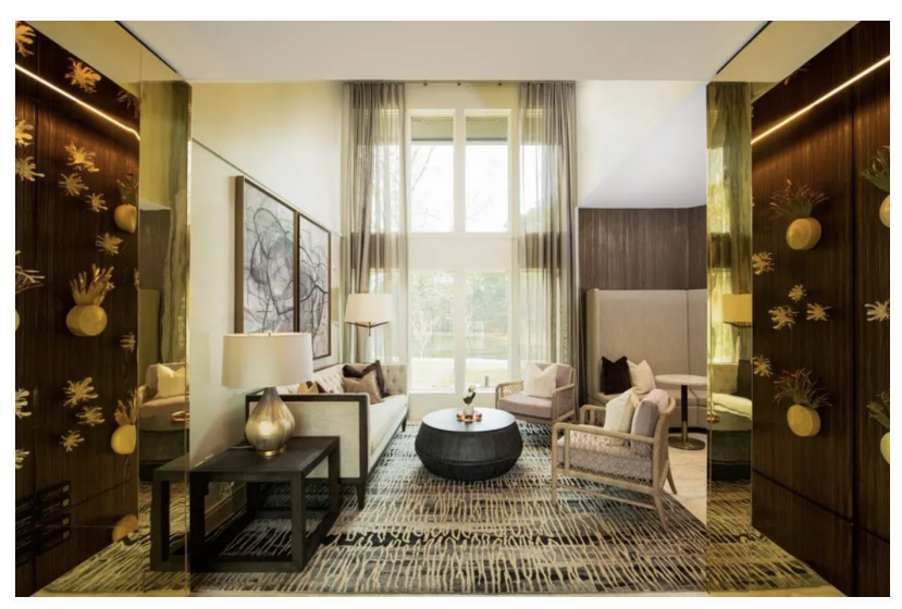
Spa H features six treatment rooms and relaxation area. HOTEL HARTNESS